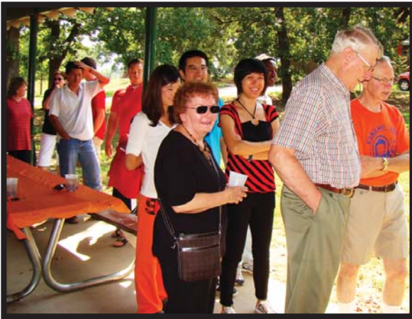
Emeriti, staff, and graduate students line up for the buffet at the departmental picnic.