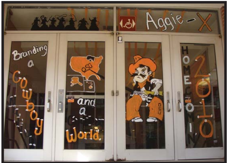
The front door of Ag Hall features the Aggie-X Club homecoming decorations.