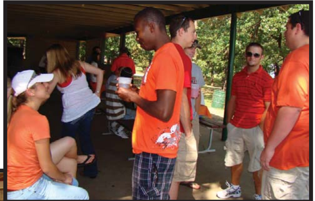
Graduate students visit at the departmental picnic at Lake Carl Blackwell.