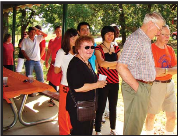
Emeriti, staff, and graduate students line up for the buffet at the departmental picnic.