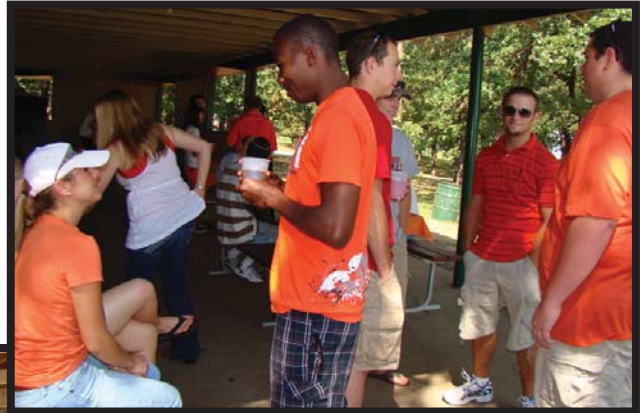
Graduate students visit at the departmental picnic at Lake Carl Blackwell.