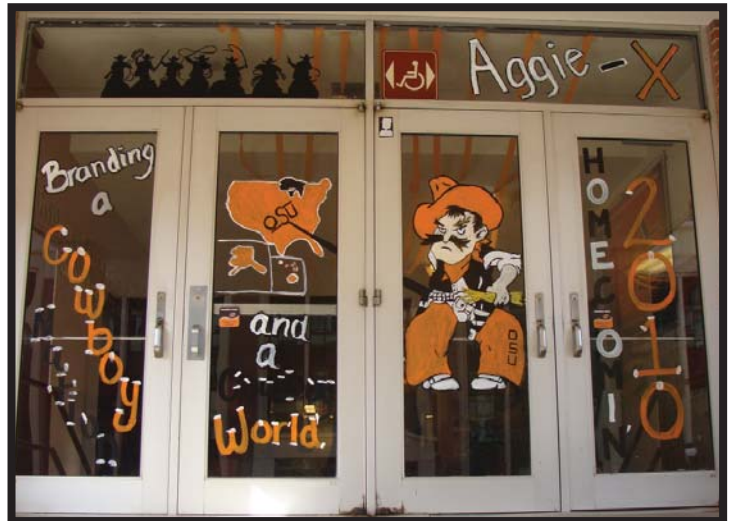
The front door of Ag Hall features the Aggie-X Club homecoming decorations.