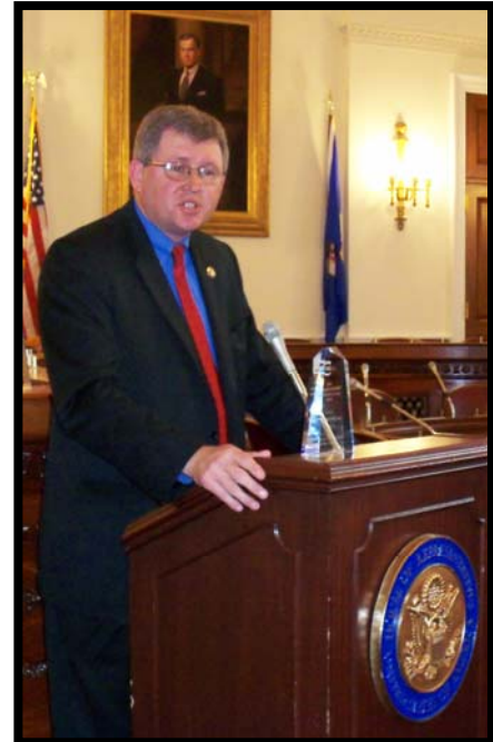
Congressman Frank Lucas speaks after being honored by C-FARE.