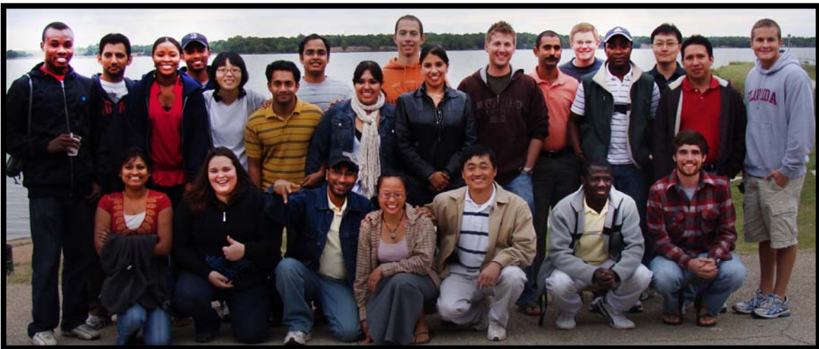
Graduate students enjoy the Ag Econ departmental picnic at Lake Carl Blackwell.