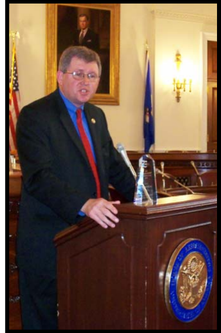
Congressman Frank Lucas speaks after being honored by C-FARE.