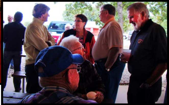
Staff and Emeriti enjoy the Ag Econ department picnic.