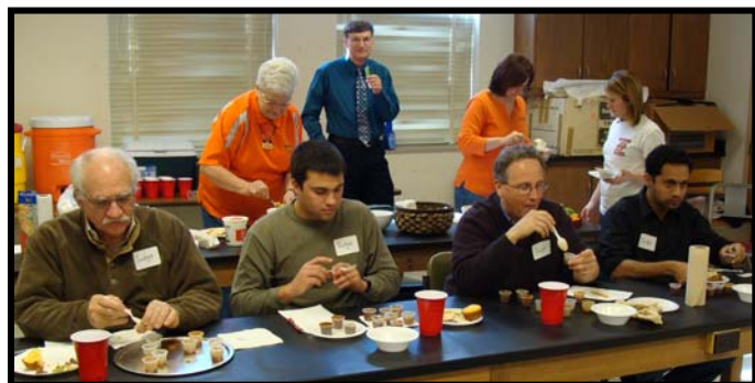
Judges at the first annual GSA Chili Cook-Off sample the many entries to select a winner.

The idea behind the planned event was to eat good food and find out who makes the best chili. It also generated a little cash for the GSA.