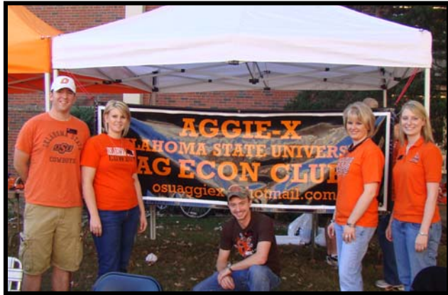
Aggie-X 2008-2009 officers at the first Tail Gate party in November 2008.