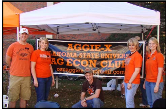
Aggie-X 2008-2009 officers at the first Tail Gate party in November 2008.