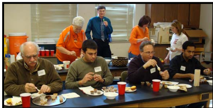
Judges at the first annual GSA Chili Cook-Off sample the many entries to select a winner.