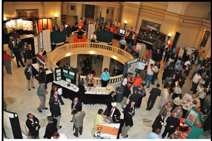
DASNR Day at the Capitol displays on the second floor rotunda of the Oklahoma Capitol.