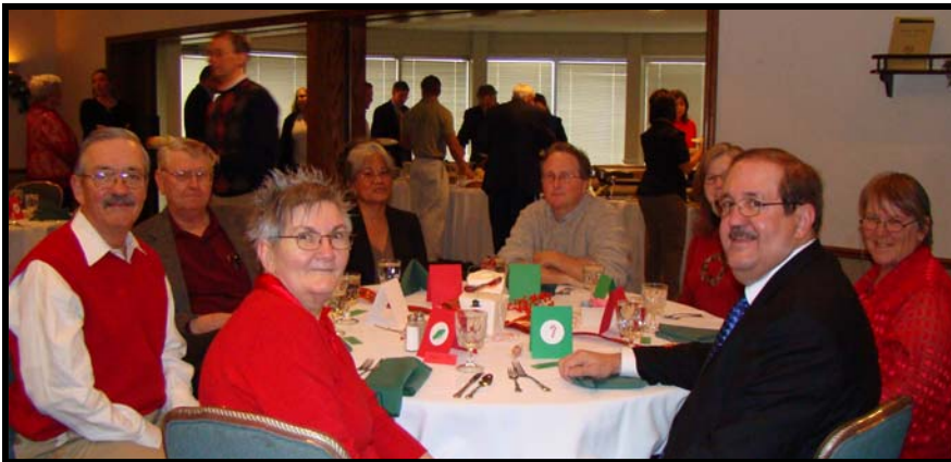
Ag Econ staff, faculty, and emerti enjoy the 2008 Holiday Luncheon.

The Ag Econ faculty members provided a delicious Holiday Luncheon for the staff in the department. Staff members were recognized for length of service and other accomplishments. The event was held at the Stillwater County Club in December and also included departmental emeriti.