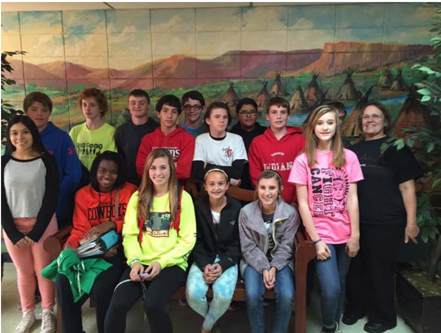
Kids from Comanche Middle School